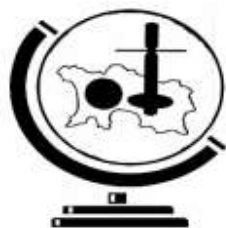
PLATE COMPETITION JERSEY BAR BILLIARDS LEAGUE WORLD CHAMPIONSHIP 2011