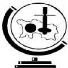
PLATE COMPETITION JERSEY BAR BILLIARDS LEAGUE WORLD CHAMPIONSHIP 2011