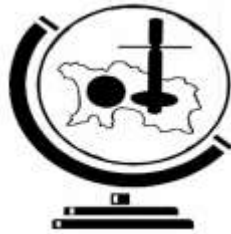
PLATE COMPETITION JERSEY BAR BILLIARDS LEAGUE WORLD CHAMPIONSHIP 2011